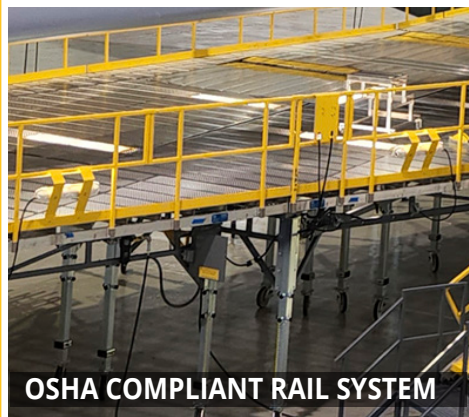
OSHA COMPLIANT RAIL SYSTEM